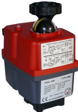
The new J3C - 55 Quarter turn electric valve actuator

Visual indication of the actuator's operating status is constantly shown by a highly visible LED light, and the new highly visible dome indicator, introduced in 2011