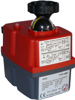
The new J3C - 35 Quarter turn electric valve actuator

Visual indication of the actuator's operating status is constantly shown by a highly visible LED light, and the new highly visible dome indicator, introduced in 2011