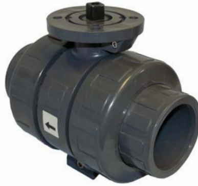
With mounting kit for actuator